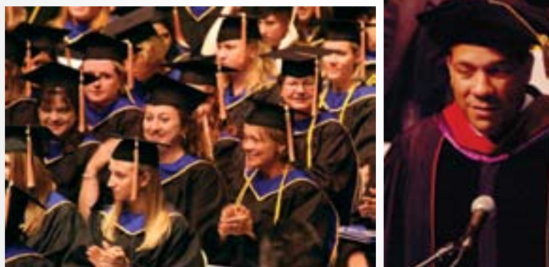
Members of the class of 2006