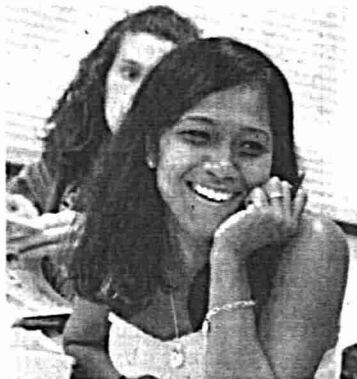
Students pursue master's degrees in education at UMW's College of Graduate and Professional Studies.

Degrees: Ed.D; Ph.D; M.A.; M.Ed.; M.I.S.; M.S.; Graduate certificates: 16 programs