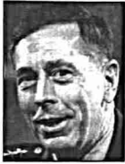
Gen. David Petraeus