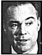
Gov. Tim Kaine

Details: 10 a.m. on the front lawn of the Salem campus (rain location: Bast Center)