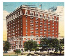
The Patrick Henry

Look no further than the Patrick Henry Residence Hall!