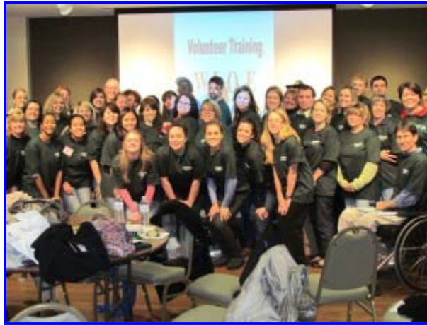
Volunteers from last week's "Point In Time" count of the homeless.