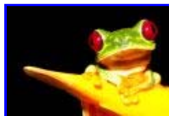
• Hanging in There