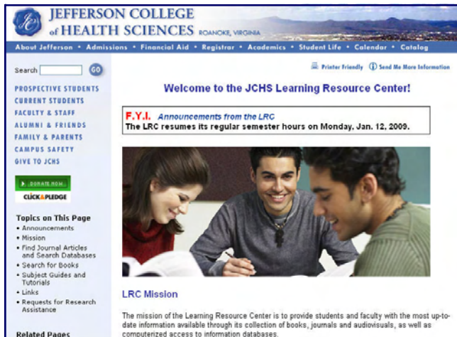
Above: LRC home page on the JCHS website

page, just go to “Academics” in the top horizontal menu on any page of the JCHS website, then click on: “Learning Resource Center.”