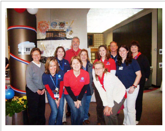
Student Affairs Team celebrating with students on Spirit Day, January 20, 2009. To hear more about this event, go to page 4.

Take a look at the rest of this newsletter to get an idea of